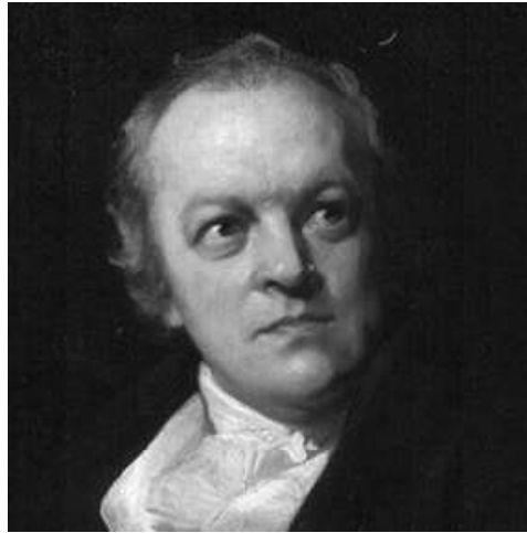
Fig. 2.4 William Blake

a romantic or a pre-romantic poet does not matter as the philosophical, metaphysical, political ideas that are manifest in his writings remains intact. Moreover, if one looks at his poetry and tries to look at the major themes and ideas dealt in them, then one is bound to classify him as a Romantic Poet.