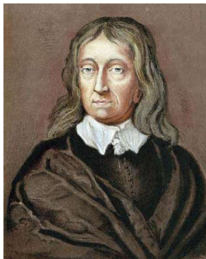
Fig. 2.3 John Milton