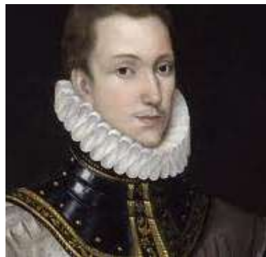
Fig. 2.1 Sir Philip Sidney

Philip Sidney was born at Penshurst (Kent) on 30 November 1554. He was the eldest son of Sir Henry Sidney and Lady Mary Dudley. His mother was the eldest daughter of John Dudley, Duke of Northumberland and sister of Robert, Earl of Leicester and Ambrose, Earl of Warwick. Thus, we can say that Sidney belonged to the aristocratic class. This had direct implications on his hopes for the future and his reactions when it did not unfold as he had anticipated.