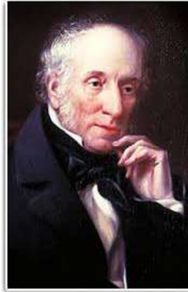
Fig. 2.5 William Wordsworth